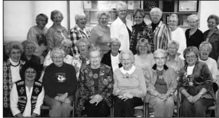
Members of Trinity Lutheran LWML of Blue Hill, Nebr.

The 39 members of Trinity Lutheran LWML of Blue Hill, Neb., volunteered 7,526 hours in 2008. Thirteen members are 80 years young, with one member over 90. They made 32 quilts for the needy, plus 17 nursery caps to be used at the local hospital. They participated in the "In Gathering" for the Convention and the Fall Rally. Food was collected for the local food pantry. Some members decorated a Christmas tree for their organization at the Webster County Museum. The members help to entertain at the local care center with Bingo and sponsoring a birthday party one month out of the year.